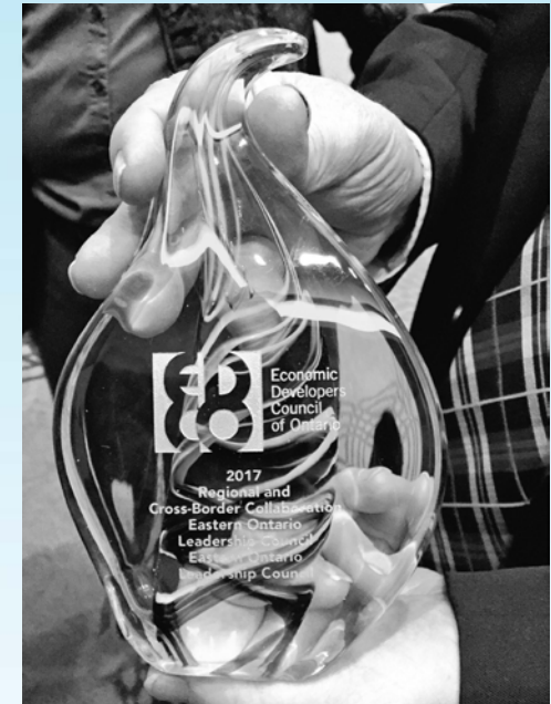
EOLC won an EDCO regional collaboration award in 2017